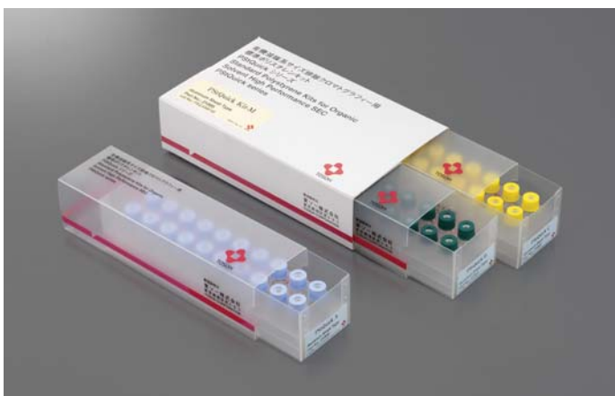
Figure 1. PStQuick standards

PStQuick GPC polystyrene standards are premixed and ready to use directly from the vial – just add solvent. These standards have been formulated to provide a wide range of molecular weight standards and are the ideal choice for Tosoh GPC columns.